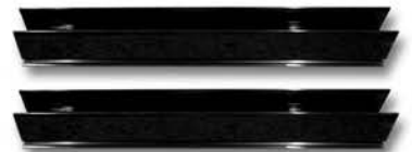
2 Strut Brackets